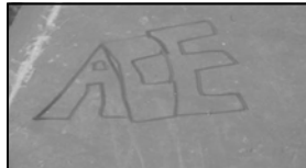
Graffiti on Rosewood

G raffiti: Within the last few months we've had two cases of graffiti. One incident was on the side of a house