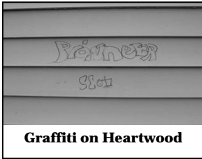
Graffiti on Heartwood

warded it on to the Gang Enforcement Taskforce. If you notice graffiti, notify the board through CMI so we can document and report it.